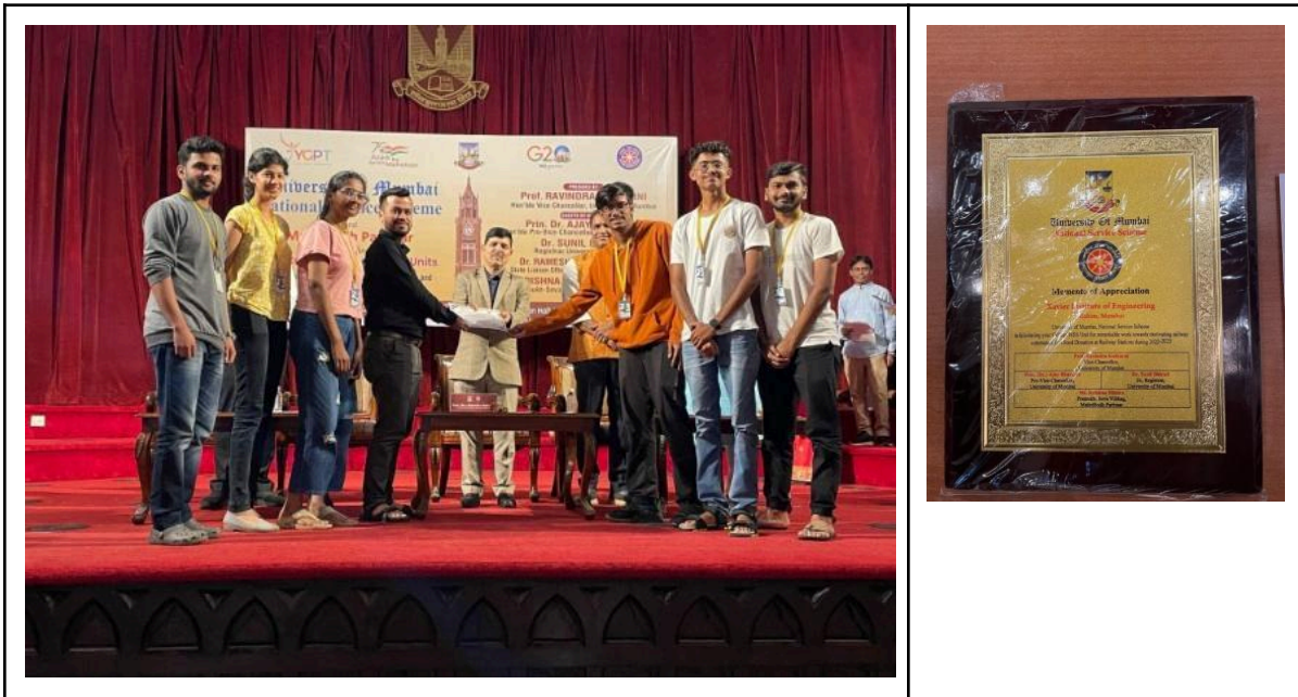
Award received on 25.07.2023 for the remarkable work towards motivating railway commuters for blood donation at railway stations

Mahim Causeway, Mahim, Mumbai - 400 016 • Phone : +91 7249371505 / +91 9920407274 Email ID : office@xavier.ac.in • Website : www.xavier.ac.in